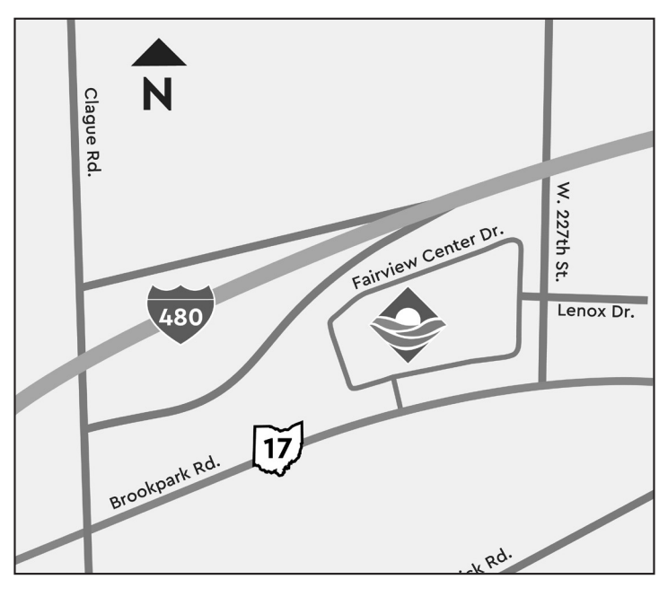
West Campus 22730 Fairview Center Drive Fairview Park, OH 44126